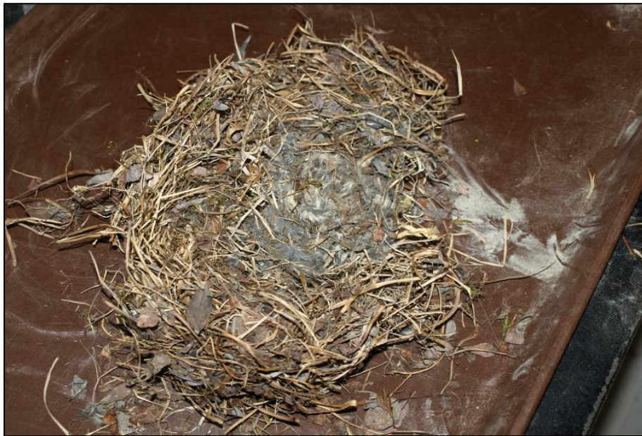
Figure 1. Examples of lemming nests with a dense carpet of hair showing predation by a weasel.