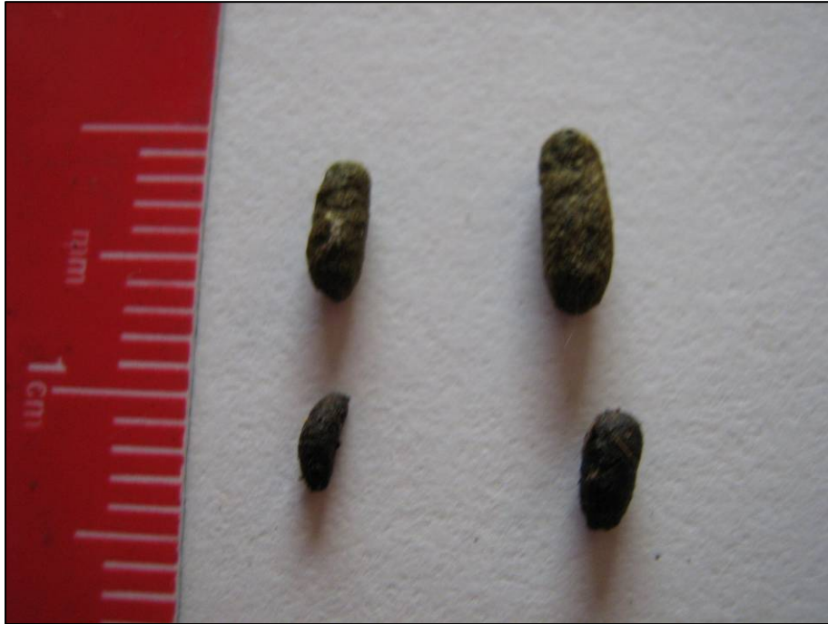
Figure 4. Faeces of Brown (top) and Collared (bottom) Lemmings. In the bottom left corner you can see the pronounce curve frequently observed in Collared Lemming faeces.