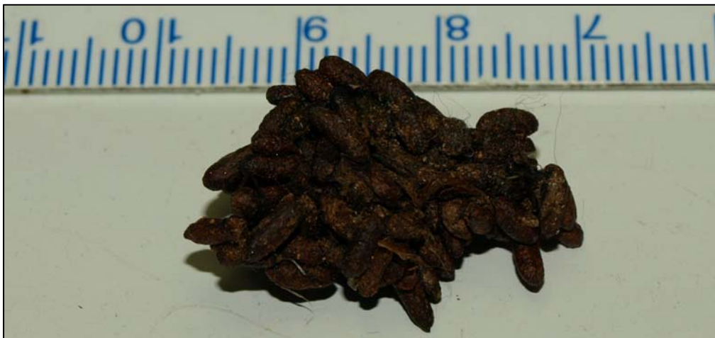
Figure 5. Aggregations of small reddish faeces found outside a lemming nest.