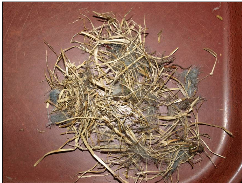
Figure 3. Example of a lemming nest where moult occurred.