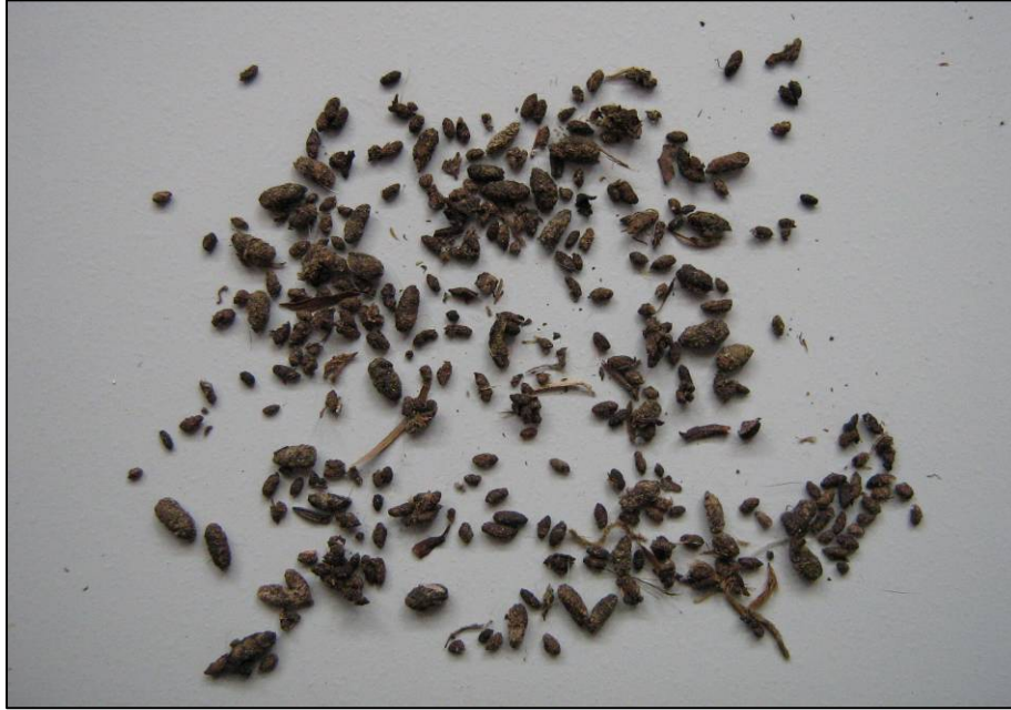
Figure 6. Example of faeces distribution found inside a nest with evidence of reproduction.